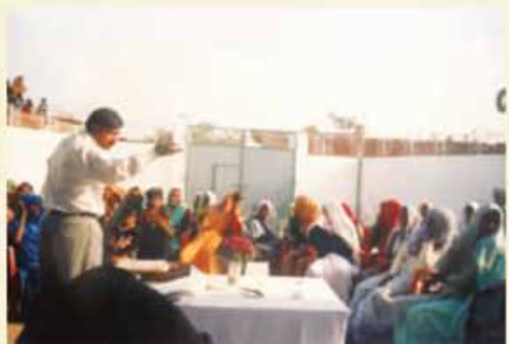
Milk Collection Hygiene and Quality Assurance Training at VLCs.