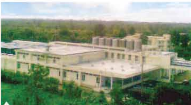
LIQUID MILK PACKING PLANT