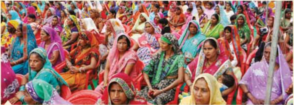
Conference of 2000+ Self Help Group (SHG) Members on International Women's Day.